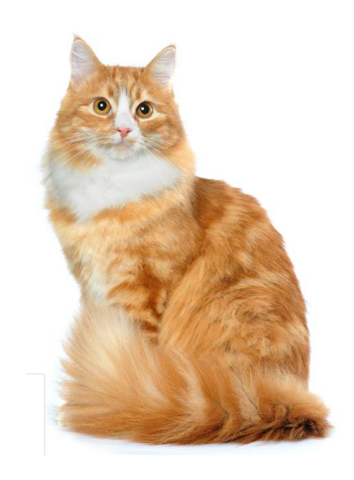
I see a cat.