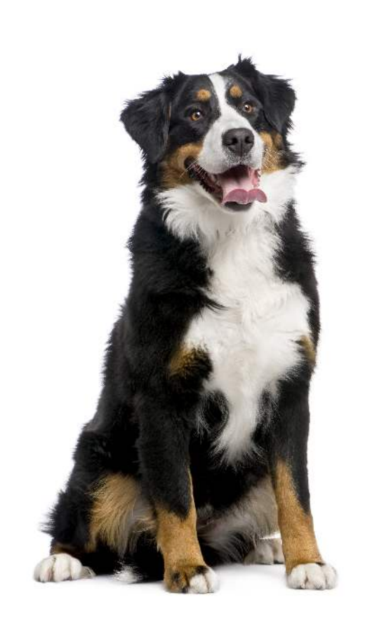
I see a dog.