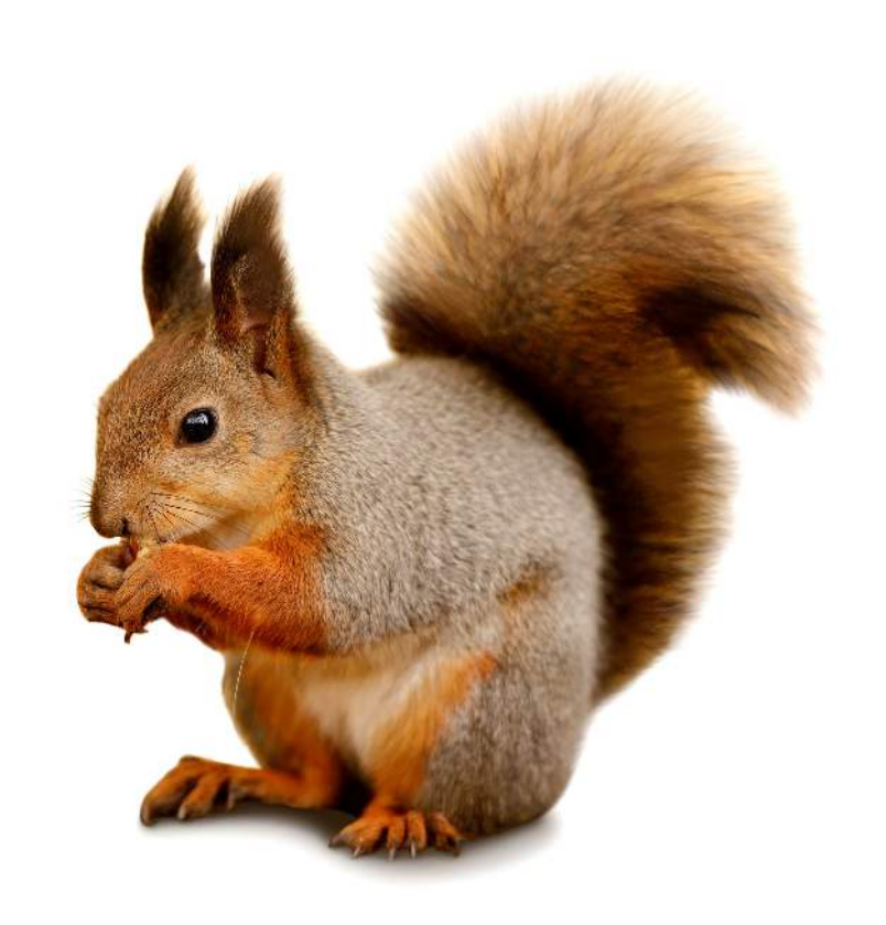
Bye bye, squirrel.