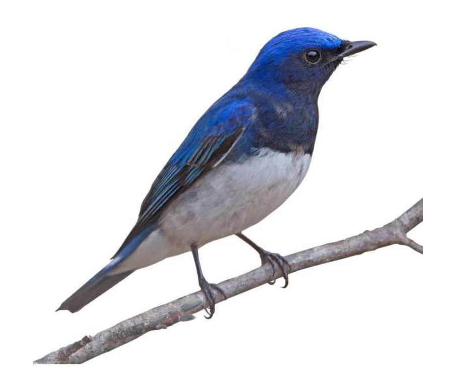
I see a bird.