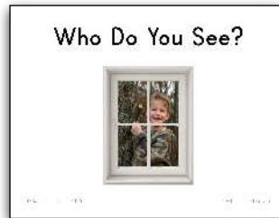
Who Do You See? Classroom Template