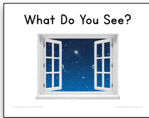
What Do You See? ORIGINAL

for What Do You See? Book Series from Tuneful Teaching