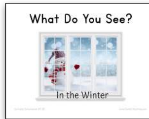
What Do You See? In the Winter